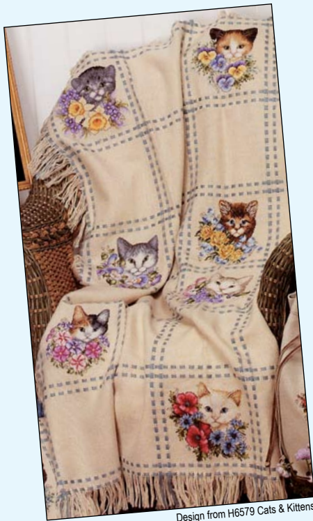
Design from H6579 Cats & Kittens