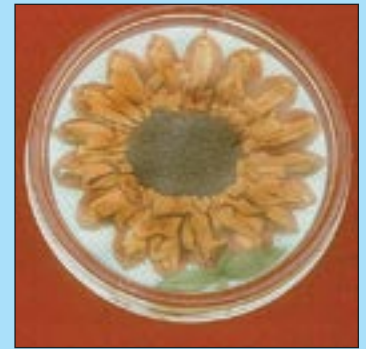
3292 Round design size 3" 5.96