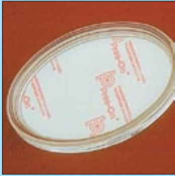
7303 Oval design size 2½"x4" 5.96

use them as coasters. Size indicates approximate design area. Packaged with finishing kit.