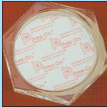
7305 Hexagonal design size 3" 5.96