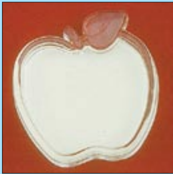
4413 Apple, design size 2 1/4"x2 3/4" 5.96