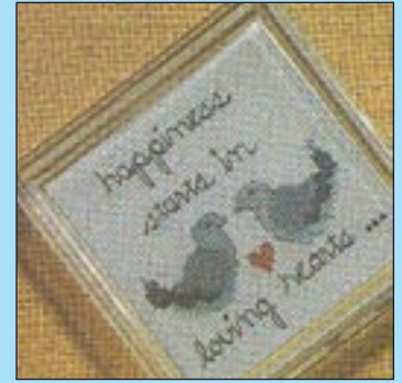
3288 Square design size 3"x3" 5.96