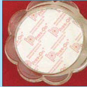
7306 Scalloped Round design size 3" 5.96