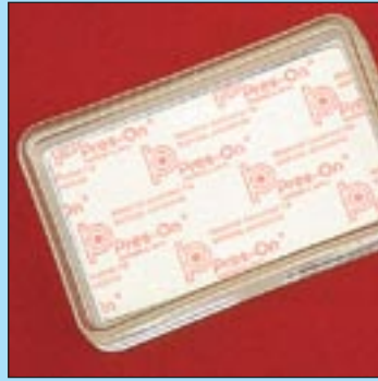
7304 Rectangular design size 2¼"x3¾" 5.96