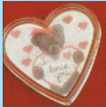
7307 Heart design size 3½"x2¾" 5.96