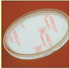
7303 Oval design size 2 1/2"x4" 5.96

Size indicates approximate design area. Packaged with finishing kit.