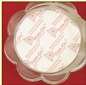
7306 Scalloped Round design size 3" 5.96