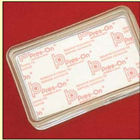
7304 Rectangular design 2 1/4"x3 3/4" 5.96