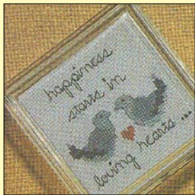
3288 Square design 3"x3" 5.96