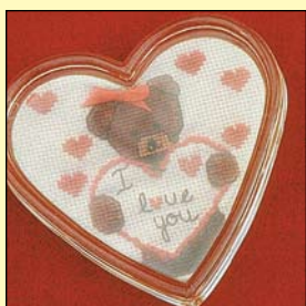
7307 Heart design 3 1/2"x2 3/4" 5.96