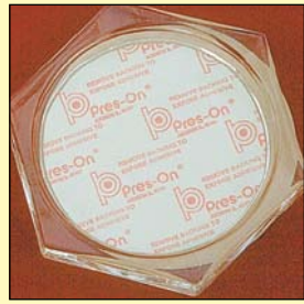
7305 Hexagonal design size 3" 5.96