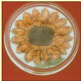
3292 Round design size 3" 5.96